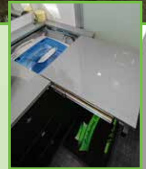
Anniversary Limited Edition 17ft 6in